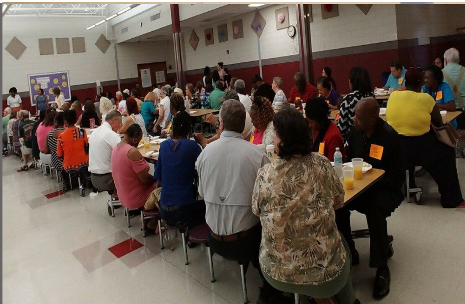
Parents receiving valuable information at a school's parent night

Additionally, the Title I department will provide training to principals so principals will understand parent and family engagement requirements and plan opportunities for family engagement activities and meetings for the remainder of the school year.